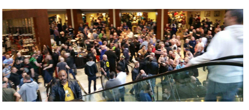
Another Mid Atlantic Leather weekend has concluded.

There were over 1,000 full weekend registrations with over 6,000 people attending. The highlight of the weekend was the Mr. MAL contest. There were five exceptional candidates competing to be the title holder for 2015. Another major event was Leather Cocktails. The members of Centaur MC greeted each guest with enthusiastic applause. The food was exceptional and the refreshments flowed freely. The parade of clubs represented sixty-four backpatch clubs.