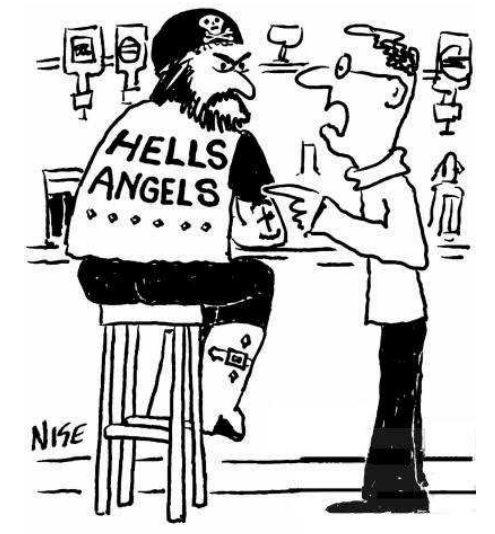
I'm sorry, but shouldn't there be an apostrophe in that?