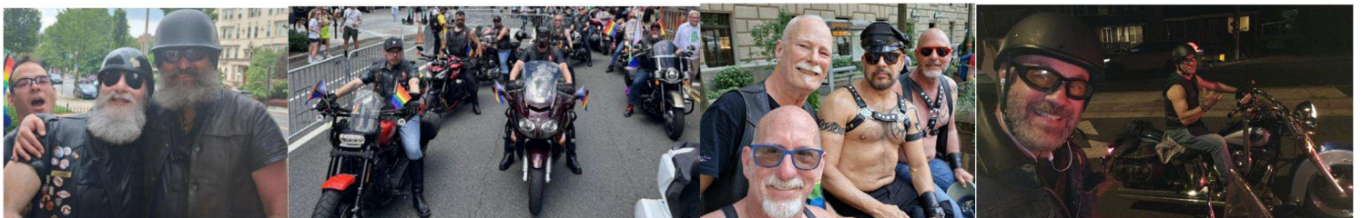
Lots of friendship and comradery!