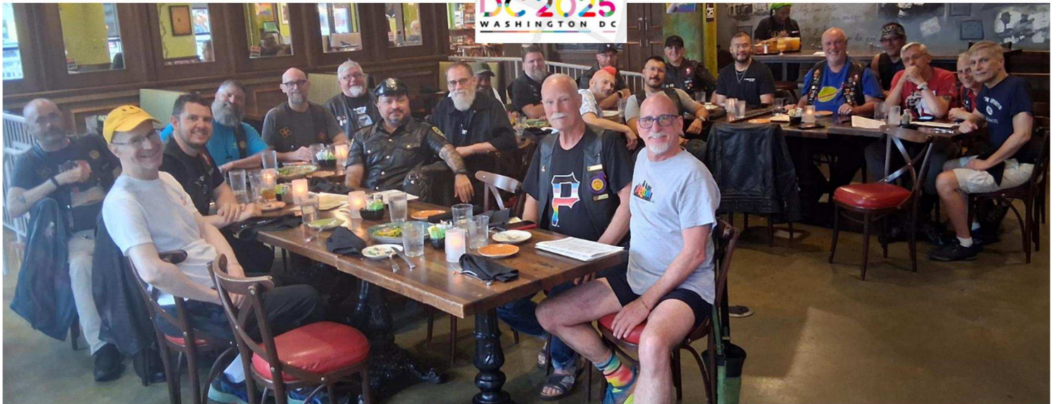
The night before pride, many of the bikers gathered at Busboys and Poets to discuss Pride March plans.